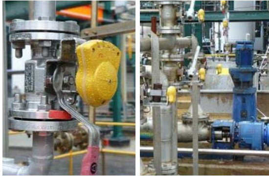
Wireless Valves Monitoring Devices in a Process Line Facility

by demodulating the received signal with a replica of the same modulating pseudo-random digital sequence. The DSSS signal process spreads the original signal into a wider bandwidth for transmission over the channel, and then disperses the signal at the receiver to recover the original signal and the information it contained.