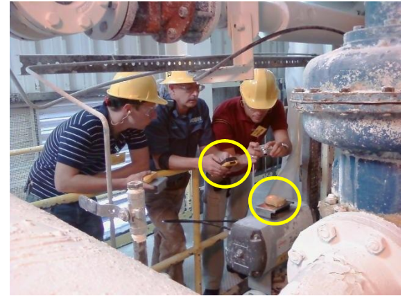
Configuring a VD using the Eltav OD

The following are typical comments we received from PQ staff: