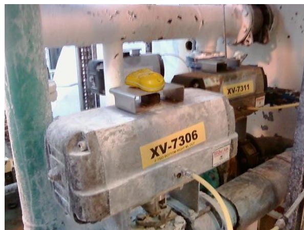
Eltav’s VD Installed on an Actuator

Diagnostics is a software feature that detects abnormal valve or actuator dynamics. This information is the basis for preventive action.